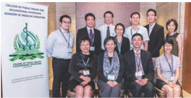
The Organising Committee of the 8 th PHOM.