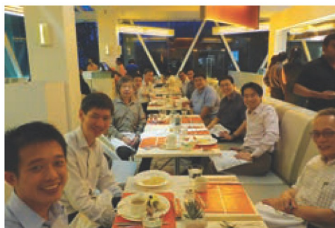
Fellows at the get-together networking session.