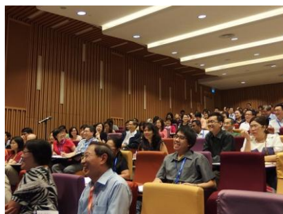
Some members of the audience.