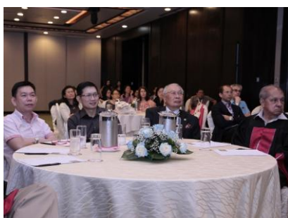
Guests gathered at the Lecture.