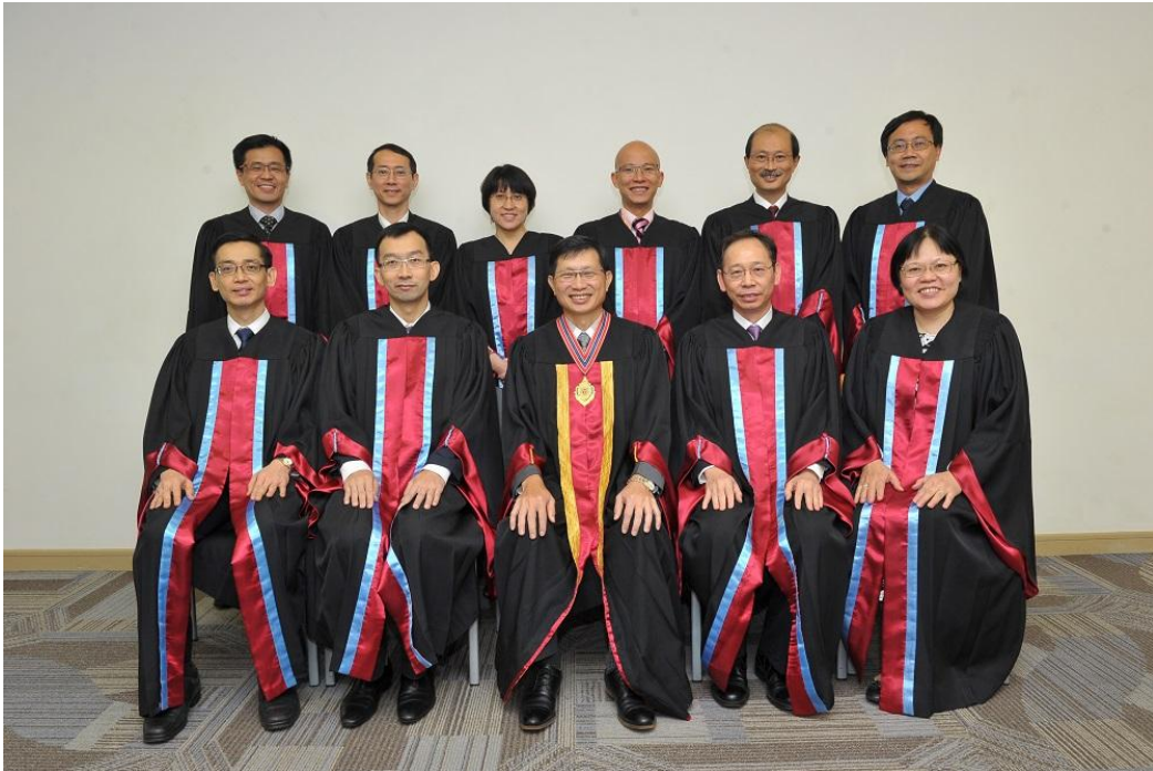
Council photo taken at the 11 th College of Physicians Lecture and 24 th Seah Cheng Siang Memorial Lecture on 30 August 2014