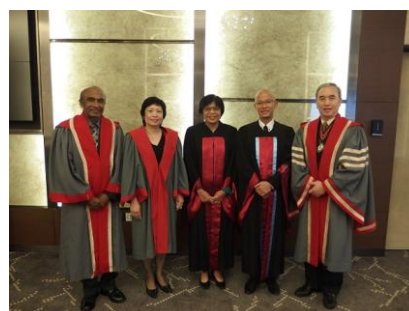
Guests gathered at the Lecture.