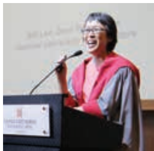
Dr Lee Bee Wah