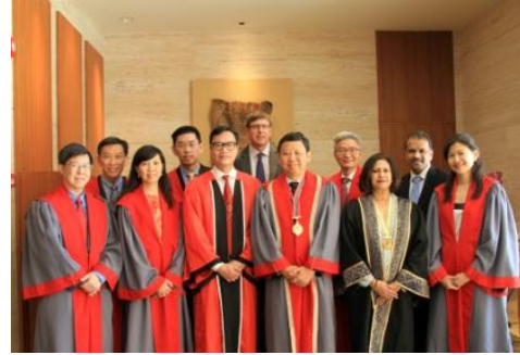
CAS Council Members and Presidents of overseas colleges