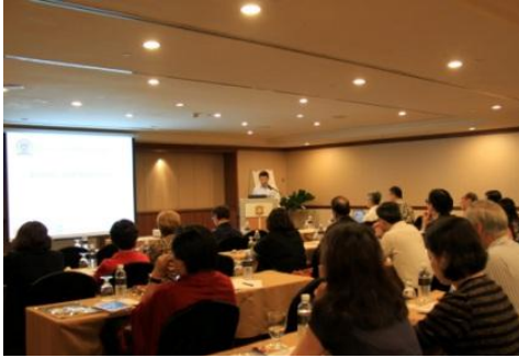
The course this year focused on evidence-based practice and current trends in anaesthesia