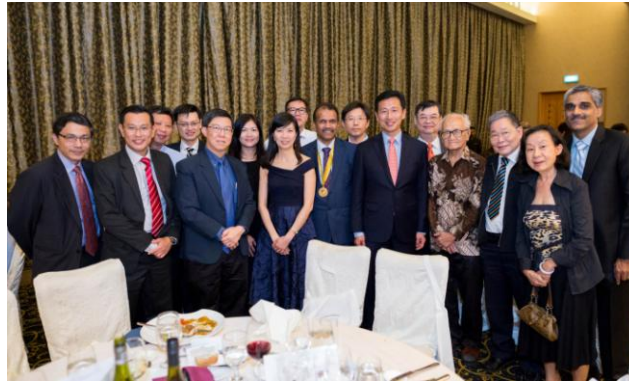
CAS Council with guests during the AMS Diamond Gala Dinner in July 2017