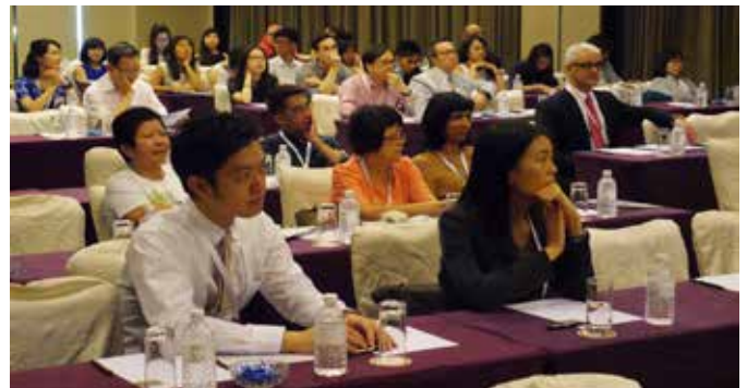
Delegates at the 2nd JCSM.