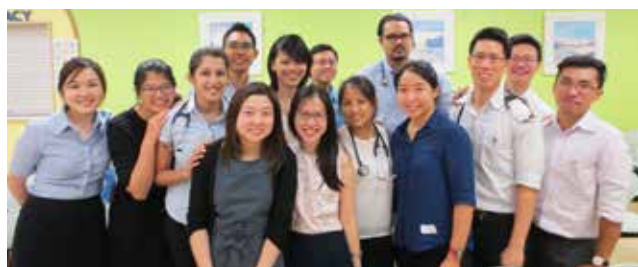
Participants of the Preparatory Course.

Well-attended by 15 participants, this Preparatory Course was held from 27 March to 1 April 2017 at the following hospitals: Singapore General Hospital (SGH), Tan Tock Seng Hospital (TTSH), Khoo Teck Puat Hospital (KTPH), KK Women's and Children's Hospital (KKH), Changi General Hospital (CGH) and National University Hospital (NUH).