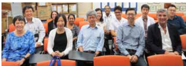
Some of the participants at the talk.