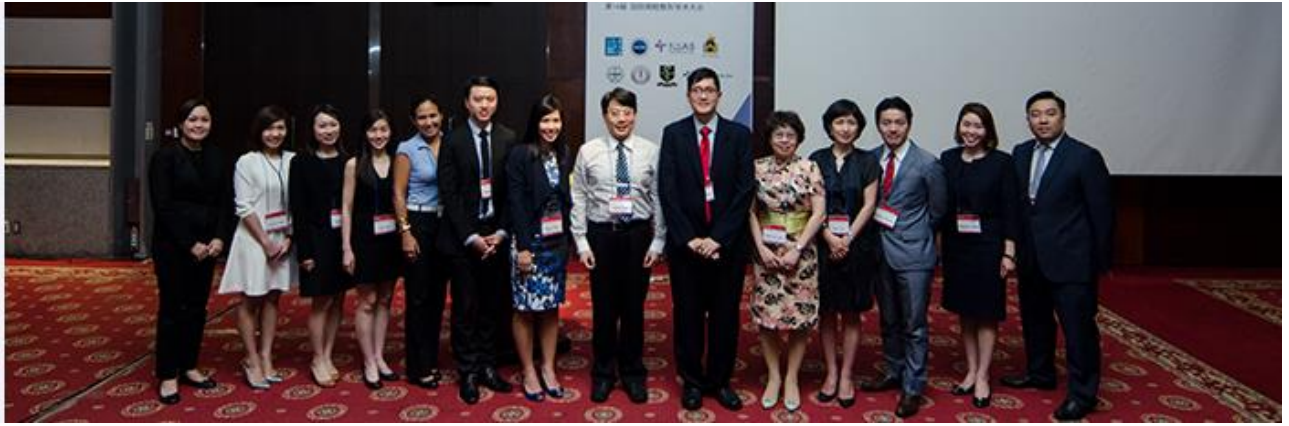
Group photo taken at KSAS Gala Dinner.