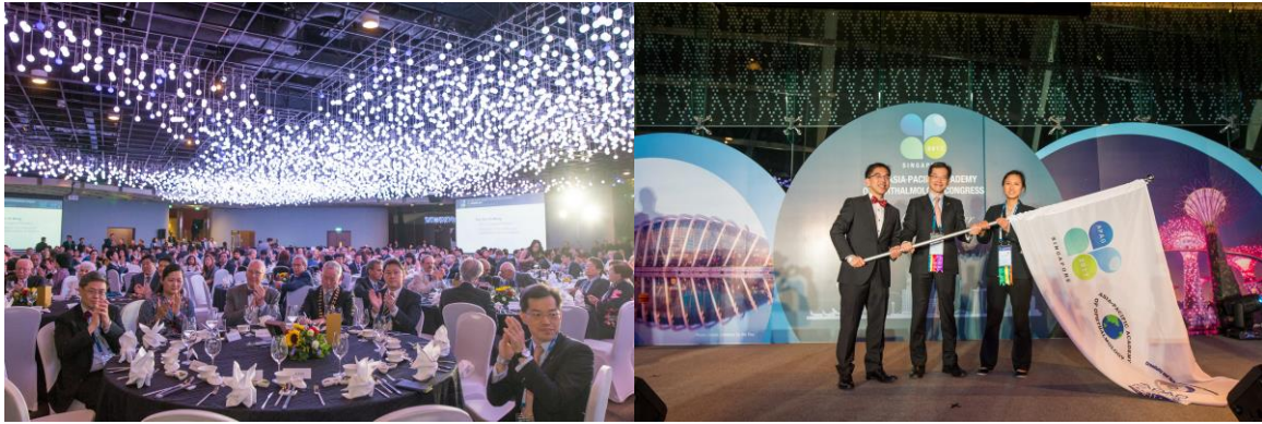
Gala Dinner photos