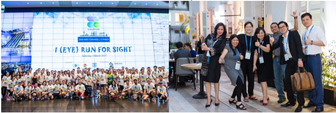
Charity Run group photo (Right) Young Ophthalmologist Night (Left)