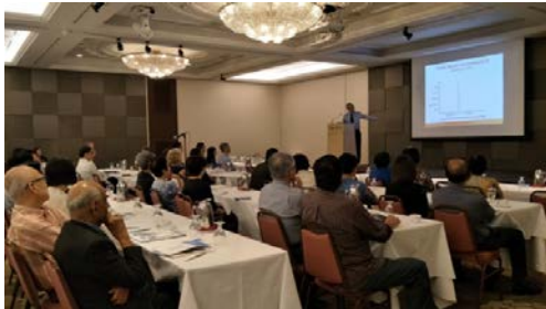
CAS 12 th Refresher Course on 7 April 2018 focussed on safer anaesthesia for patients and clinicians.