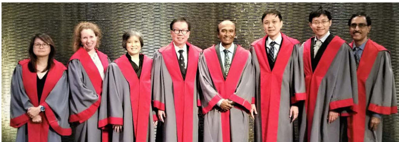
Group photo taken at 8 th Singapore Paediatrics & Perinatal Annual Congress (SiPPAC) on 27 July 2019