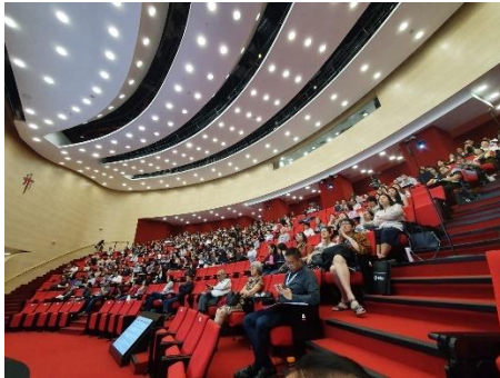
11 th Medicine Review Course

The College of Physicians held its annual Medicine Review Course on 5-6 October at the Centre for Healthcare Innovation. Into its 11th year, the Course aims to provide: (a) expert guidelines in the management of commonly encountered problems in the general medicine unit; (b) evidence-based medicine succinct update on hot topics in internal medicine and its subspecialties; and (c) concise review of disease conditions that are commonly encountered in clinical practice or examination. More than 450 attendees were present at the two-day Course.