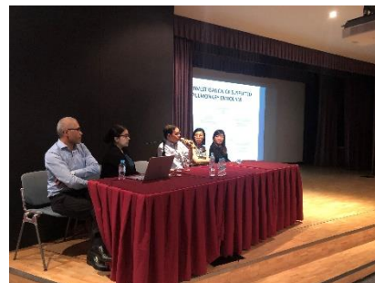
Panel Discussion consisting of representatives from Chapter of Haematologists, College of Physicians, Singapore and College of Obstetricians and Gynaecologists, Singapore