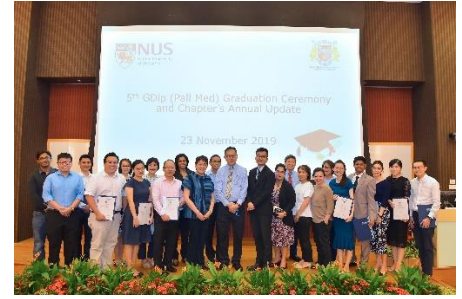
5 th Graduate Diploma (Palliative Medicine) Graduation Ceremony and Chapter's Annual Update and Appreciation Night