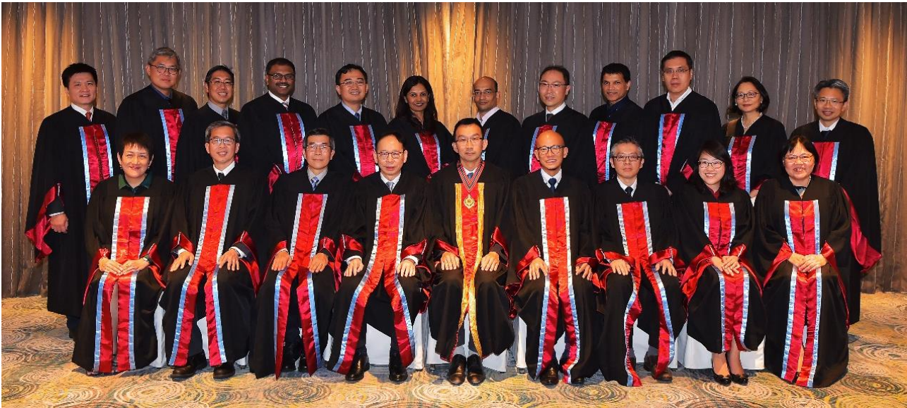
Group photo taken at CPS College Diner taken on 31 October 2019