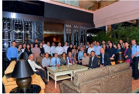
3 rd Dinner and Chapter of Medical Oncologists Night