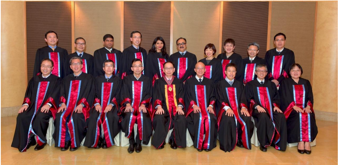
Group photo taken at CPS College Diner taken on 19 September 2018