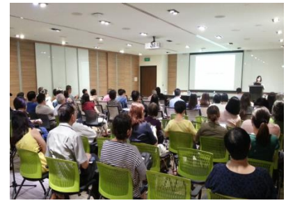
World Thrombosis Day Forum