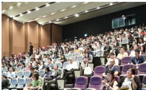
10 th Medicine Review Course

The 10 th Medicine Review Course held on 21 – 22 July 2018 at Auditorium, Lee Kong Chian School of Medicine (Novena Campus) recorded an approximate attendance of 301 participants. Together with 31 faculty members, the course featured a revamped curriculum to include problem-based approaches to medical issues faced in ambulatory clinics and inpatient wards; specialty updates addressing questions posed in medical in-training examinations; and symposiums focusing on medical ethics and dilemmas in the daily practice of internal medicine.