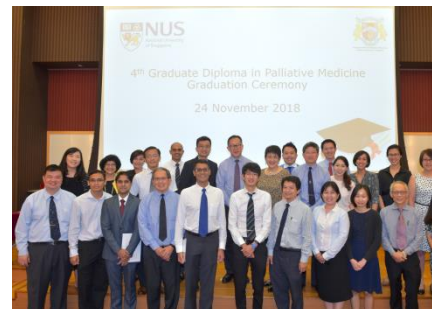
4th NUS GDPM Graduation Ceremony