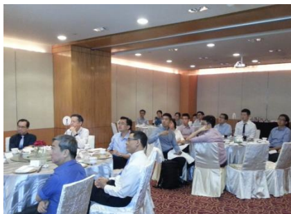
Chapter of Gastroenterologists Dinner Symposium

15 Dec Angioedema: Not Always An allergy