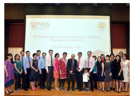
3rd NUS GDPM Graduation Ceremony