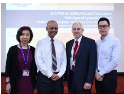
Chapter of Dermatologists Lecture and HMDP Visiting Expert Lecture

10 Nov Venom Immunotherapy Guidelines and Systematic Review