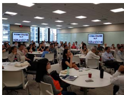
Audience at seminar on Adult Vaccinations to Prevent Respiratory Infections