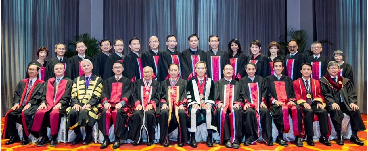
Group photo taken at the 51 st Singapore-Malaysia Congress of Medicine on 22 July 2017