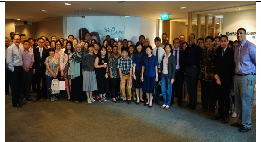
Understanding Addiction Psychiatry