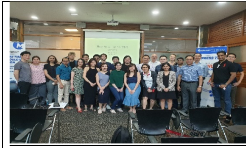
rTMS Certification Course 2019