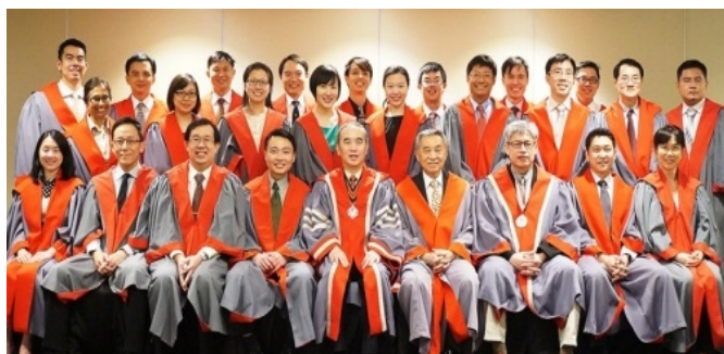
Council Members together with the Inductees