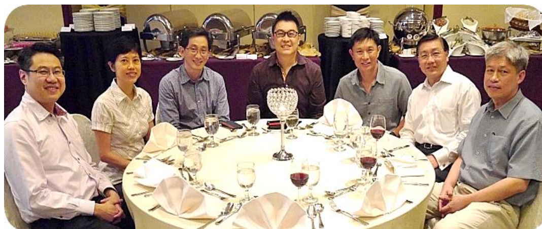
Front Row: From left: