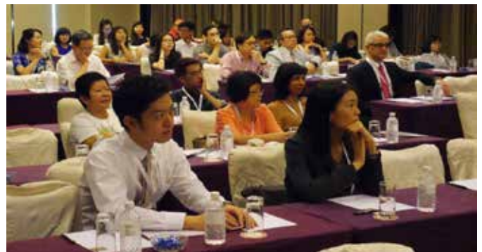
Delegates at the 2nd JCSM.