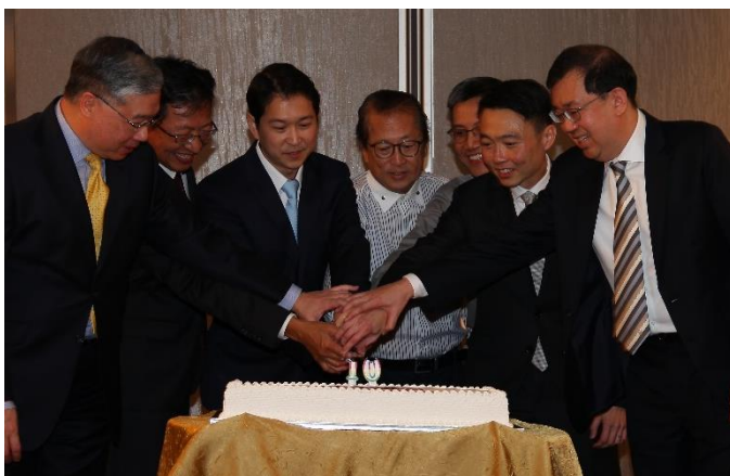
Former CDSS Presidents cutting the cake