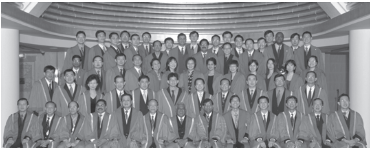
2003 - 2004 Council and President SR Nathan with inductees from the Chapters of Anaesthesiologists, Dental Surgeons, Obstetricians and Gynaecologists, Paediatricians, Psychiatrists and Public Health and Occupational Physicians at the 2003 Annual Induction Ceremony and Dinner on 10 November 2003

GUEST-OF-HONOUR: HIS EXCELLENCY, PRESIDENT S R NATHAN