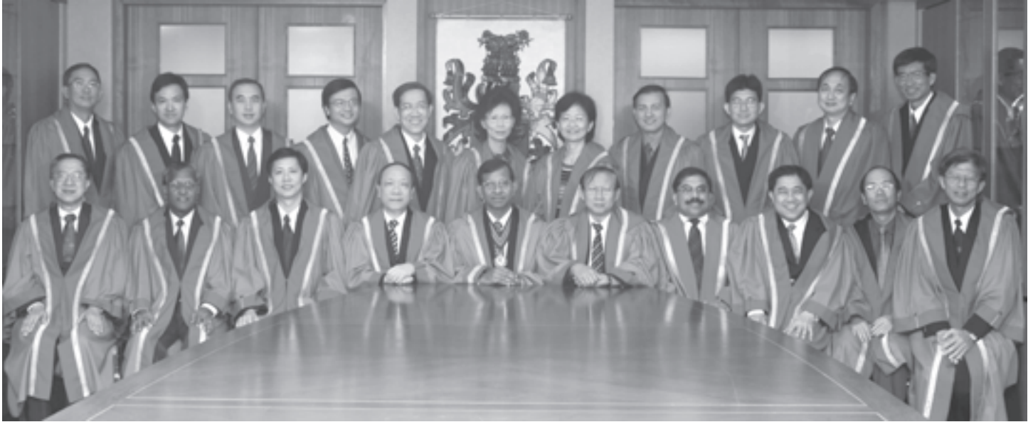
Taken at the Lee Kong Chian Room on 5 April 2004