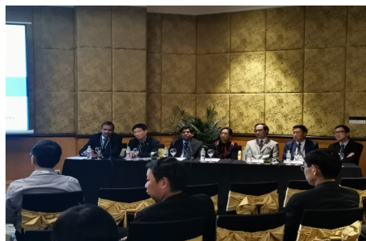
Anaesthesia Safety Forum Discussion