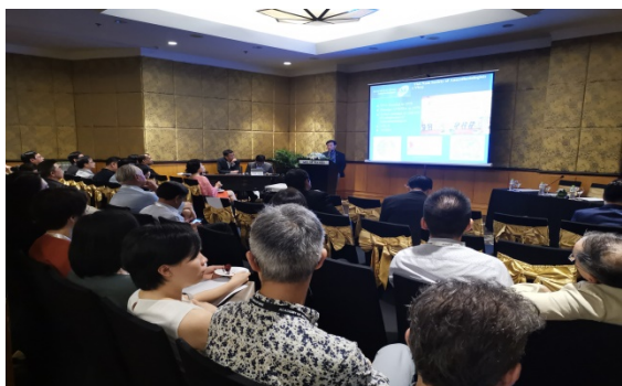
CAS 13 th Refresher Course on 6-7 April 2019 focused on Advancing Anaesthesia Safety and Precision Care