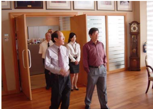
Minister of Health, Dr Khaw Boon Wan made an unofficial visit to the Academy's premises on 11 December 2008. Master, Assistant Master, Past Master and General Manager, AMS gave a quick tour of the premises followed with a presentation of AMS by Master.