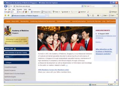
The new AMS website is more user-friendly and provides an on-line e-forum

Fock Kwong Ming Master, 2008-2009 Council